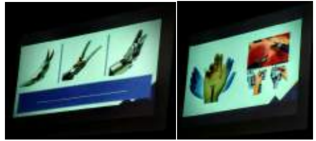
Glimpse of instruments used in robotic surgery