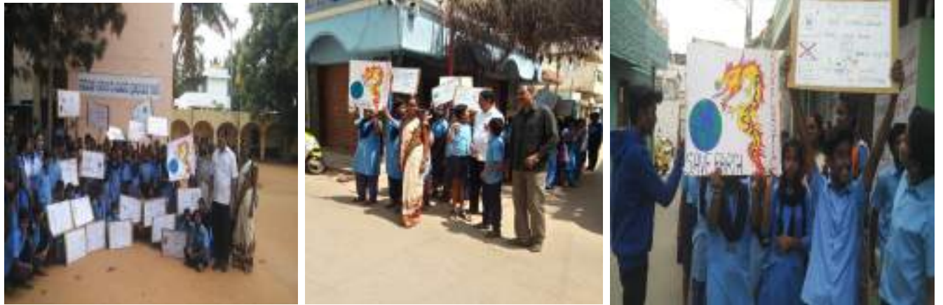
Group 2. Swachh Patashala (Clean School) Photos.