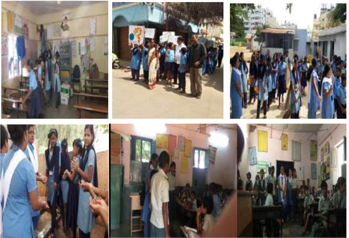
Group 3 & 4 Activity: Each One Teach One