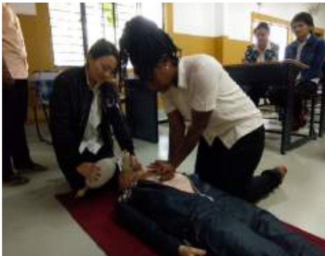
2- Rescuer Adult CPR

As a part of Skill Training programme, one day Basic Life Support Training programme was conducted for the Final Year GNM students on 19.7.18. The BLS training programme commenced by 9am with a brief introduction about the importance of early and high quality CPR. Students actively participated in the sessions. They were taught about the High-Quality CPR and use of AED. The presentation was by videos, demonstrations and hands on practice. All the students scored above average in the post test. Thus, all of them received certificate after completion of the training.