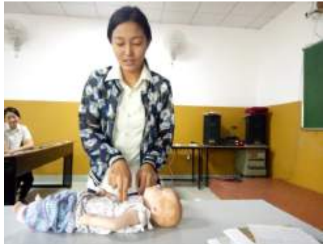
1 - Rescuer infant CPR